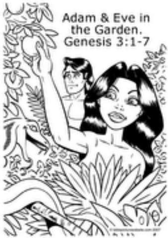
Adam & Eve in the Garden. Genesis 3:1-7