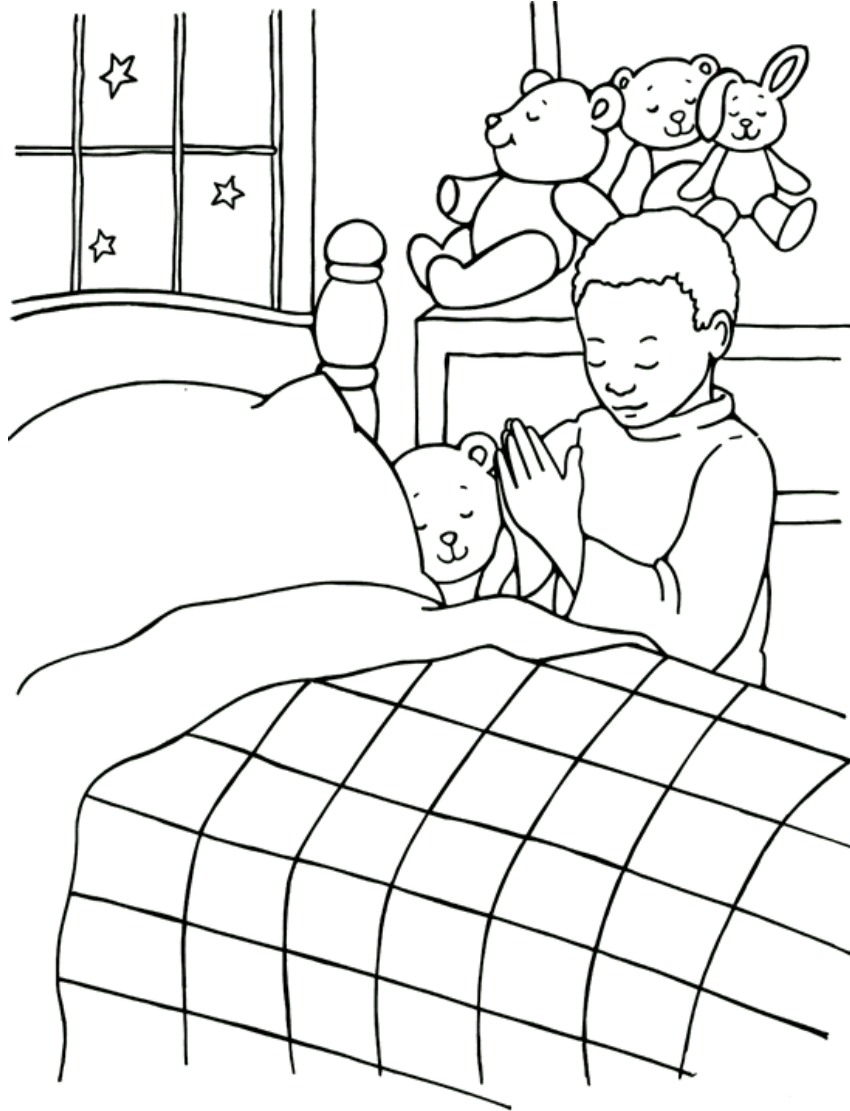
God hears my prayers.

Each number represents a letter of the alphabet. Substitute the correct letter for the numbers to reveal the coded words.