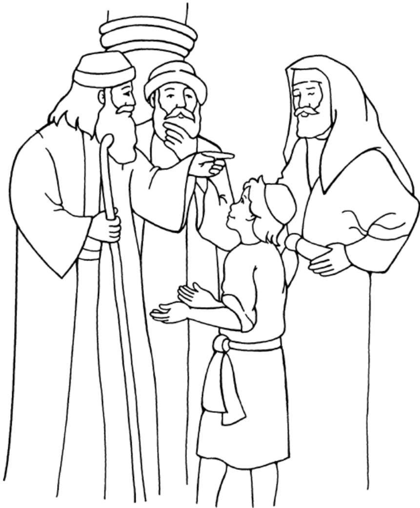
Jesus in the Temple Luke 2

From Thru-the-Bible Coloring Pages for Ages 4-8. © 1986, 1988 Standard Publishing. Used by permission. Reproducible Coloring Books may be purchased from Standard Publishing, www.standardpub.com .