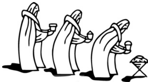
The Magi bring gifts