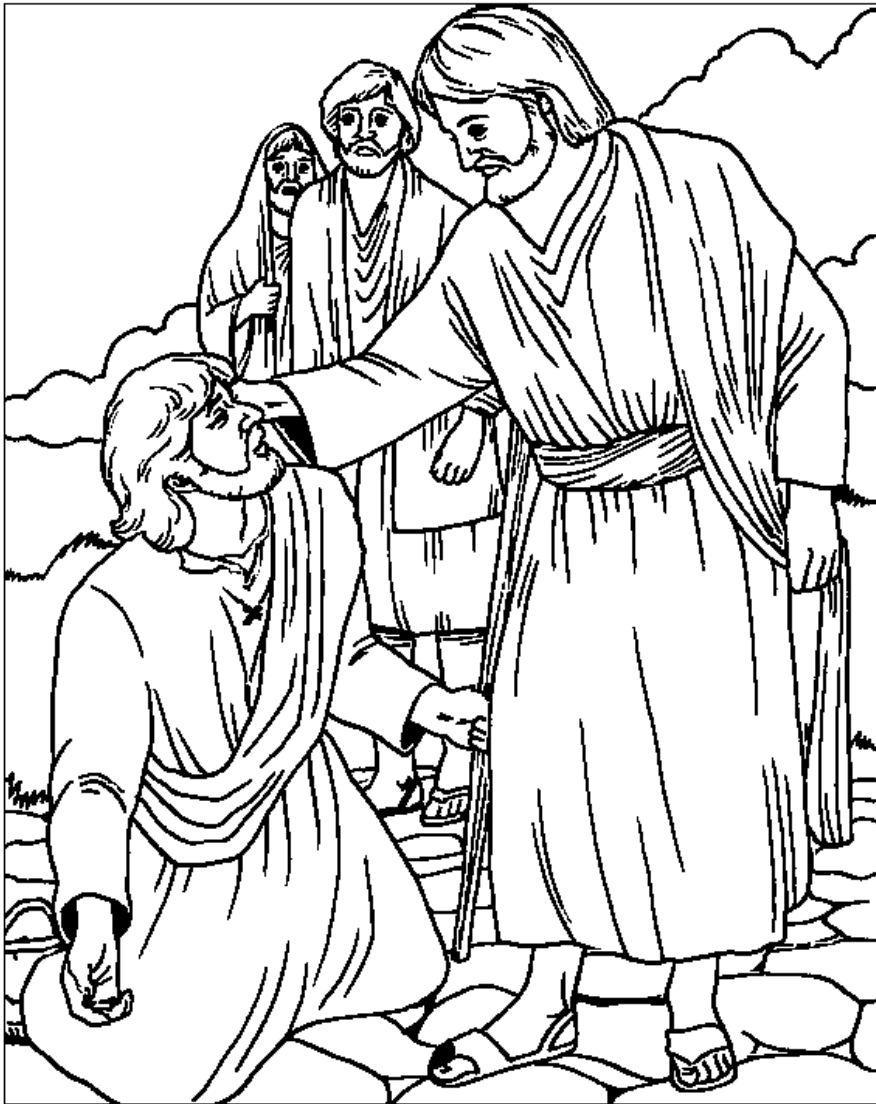
Jesus Heals a Blind Man Mark 10:46-51

Use the key to complete the phrase below.