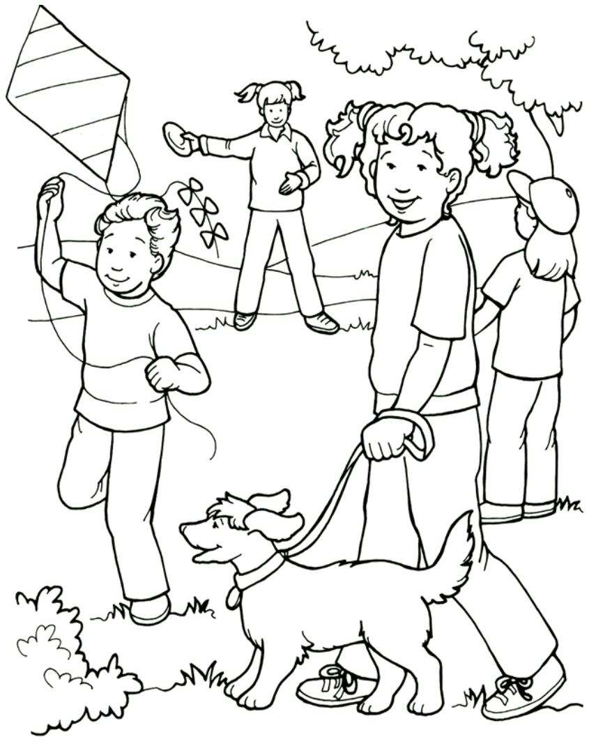
Love Your Neighbor as Yourself

From Thru-the-Bible Coloring Pages for Ages 4-8. © 1988 Standard Publishing. Used by permission. Reproducible Coloring Books may be purchased from Standard Publishing, www.standardpub.com, 1-800-543-1301.