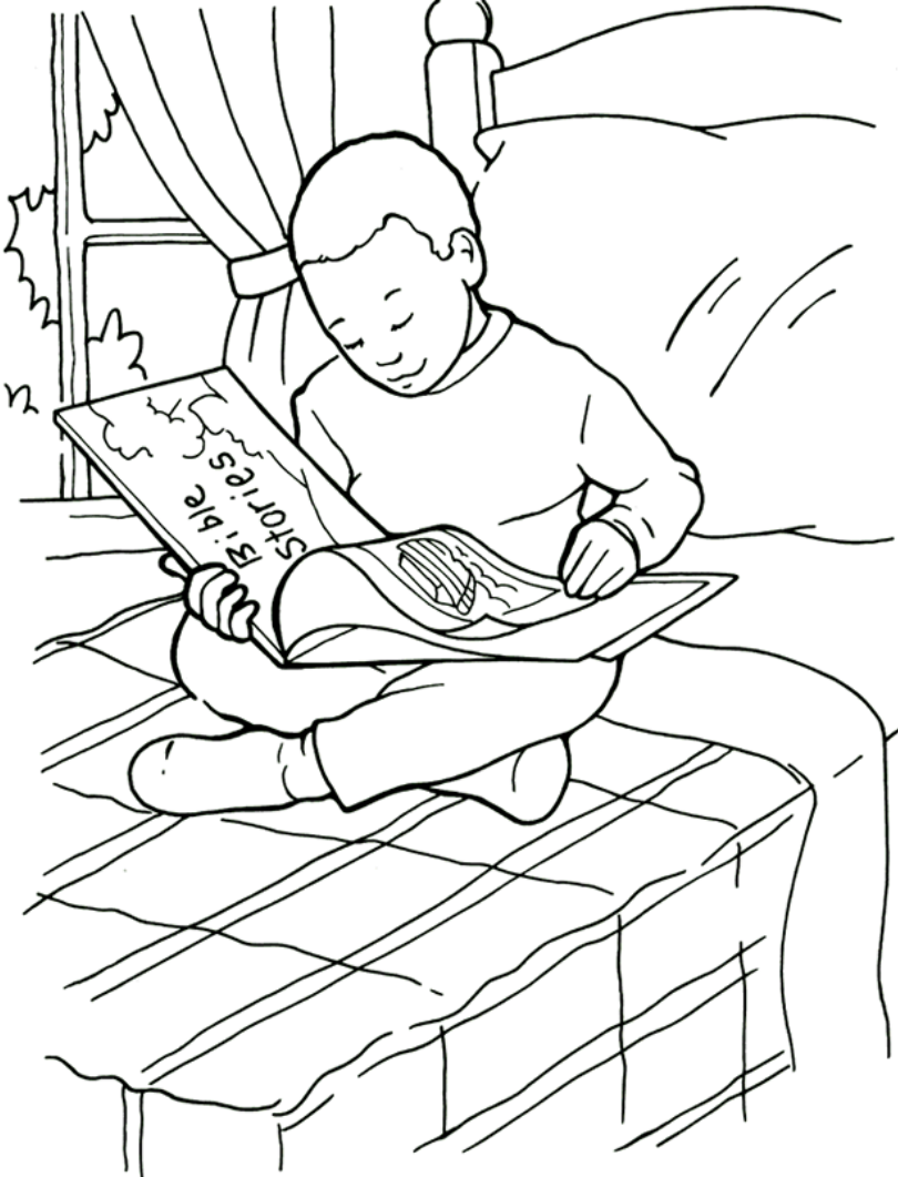
I want to follow Jesus. He is God's Son.

Each number represents a letter of the alphabet. Substitute the correct letter for the numbers to reveal the coded words.